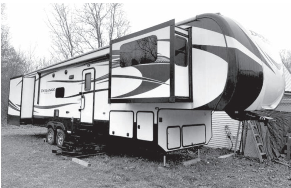
2015 K-Z Durango Gold 380FLFS 4 Seasons Coach with 5 Slide-Outs Plus African Art, Animal Mounts, and More See full list on our website.