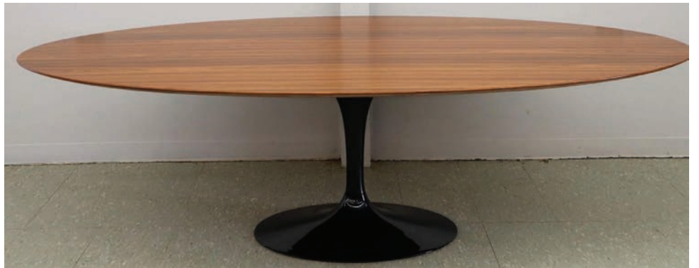
Above: Selling for $3,750, this designer Knoll dining table sure attracted a fair share of attention.

Left: This Bradley & Hubbard table lamp was a sure win at this auction at $1,200.