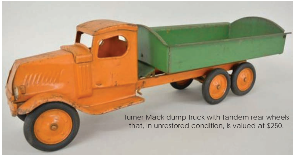
Turner Mack dump truck with tandem rear wheels that, in unrestored condition, is valued at $250.

As old, cast iron toys rusted and broke, making them useless to children, sheet metal toys caught on. Advertising for the earliest sheet metal toys suggested, "You can bend them, but they won't break. Sim-