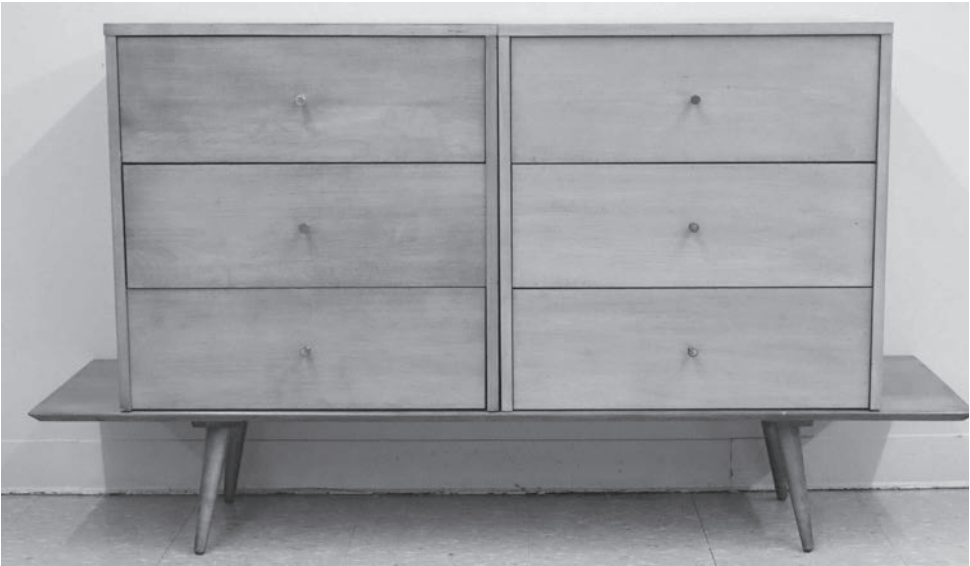
Above: This Paul McCobb dresser was a reminder of the “blonde” furniture and sold for $1,600.

long door and a shaped drop. It did show an older refinishing with minor wear, some dial touchups, and evidence the electrical components had been removed. It stood an impressive 68 ½ inches high. The final sale price on this timekeeper was $1,100. An E. Howard & Co. Re-Issue No. 10 figure-eight wall clock featured an eight-day, weight-driven time only movement and had a painted metal dial. The dark walnut case with its single shaped door and the original reverse painted glass added to its look. This one had some finish wear, a bit of minor damage, and the movement was dirty but running when cataloged. It hammered down at $700. A turn of the century clamshell excavating bucket would fall in the “unusual” category. This one was more than likely a patent model or salesman’s sample. Either way, it had very detailed construction and was made of nickel-plated bronze with pulleys and riveted construction. It was marked “Made in USA” and “OS4”. When open, it measured 7 1/4 by 3 by 8 ½ inches. This very unique piece brought a high bid price of $1,300. Schmidt’s Antiques, Inc. can be reached at (734) 434-2660 or at www.SchmidtsAntiques.com .