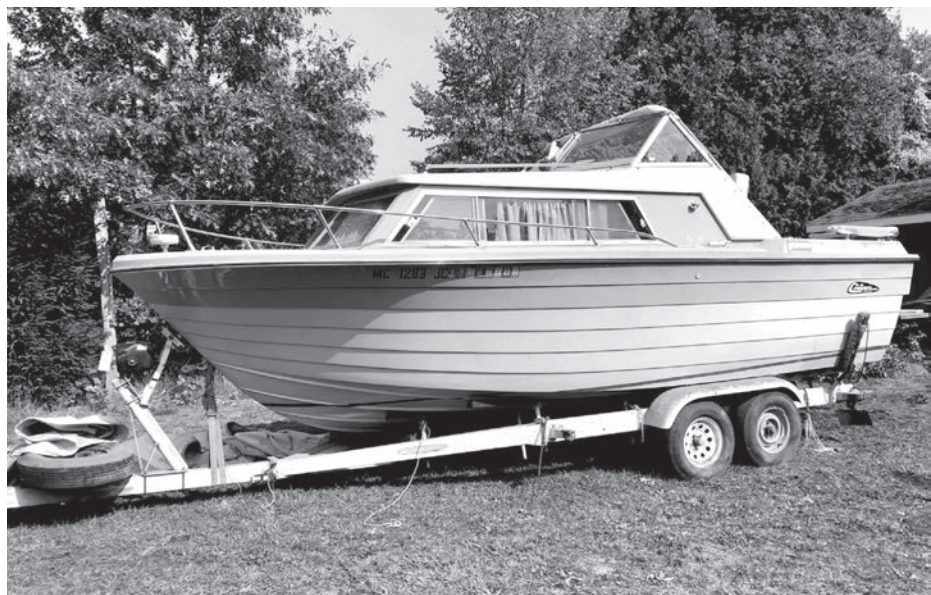
Farm machinery, truck, travel trailer, shop tools, collectables, household items, and more Selling for the Kilburn Family. See full list on our website.