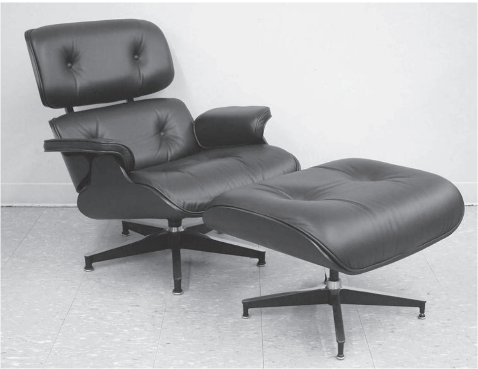
Above: This is an Eames chair and ottoman made for the Herman Miller Company. It sold for $3,250.

Below: Made by George Nelson for the Herman Miller Company, this simple swag leg desk brought an impressive bid of $1,800.