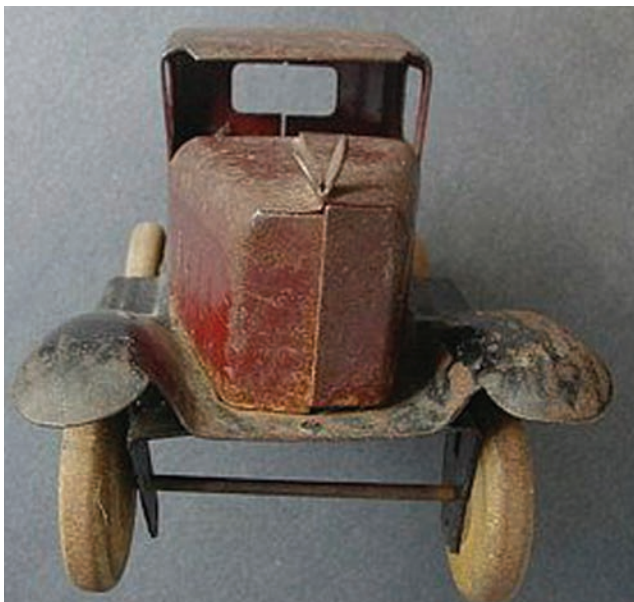
Above: Vintage, metal Turner toy truck, made of pressed steel.

Most Turner toy trucks sell for a few hundred dollars. Mint conditioned Turner trucks will bring more, but a record value was suggested when a Turner pressed steel toy bus, circa 1920s, was valued at $5 - 6,000 on the PBS television show Roadside Antiques in 2010.